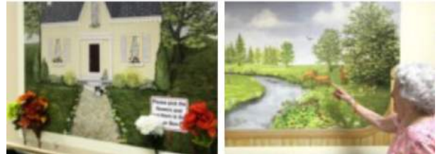
Interactive Flower mural

This beautiful mural, purchased with money from a generous private donor, will be installed when the painting on Copper Community is completed. Residents can “pick” the flowers as they walk past, and then “plant” them in the flower box. Provides purposeful activity and sensory stimulation.